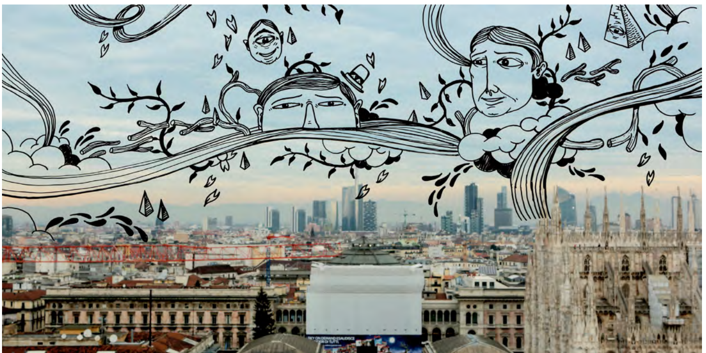
Street artist Seacreative “makes the sky bloom”. Watch all videos here, https://vimeo.com/maketheskybloom